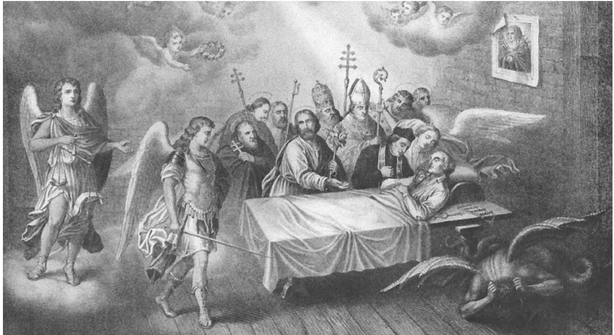
The Peaceful Death of the Just, 19th century lithograph

not force us to love him. He wants us to spend eternity with him — but the choice is ours. We have the chance to turn to Jesus while we are alive, but at the moment of death, our choice is frozen, suspended forever in time (see CCC 1021). We either die in friendship with the Lord or we die out of his grace, in persistent rejection of his love to the end. A person who dies in a state of mortal sin has made a tragic, yet free choice — and will spend eternity separated from God by his or her own choice.