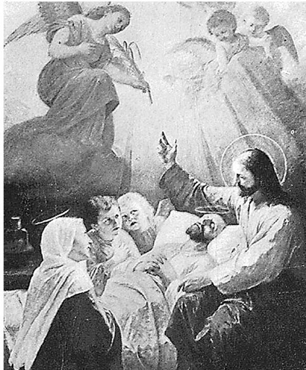
The Death of St. Joseph, by Jacob Walch, 1440-1516

"There is no joy more complete, no love more rapturous, no life more fulfilling."